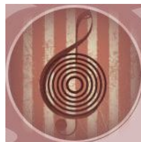
Take Note Music

We are still trying to find information about the oldest cottage in our village. If there is some special heritage about the cottage you live in, please share the history and email us historical anecdotes at admin@harfield-village.co.za . Again, we are appealing to our readers to share with us photographs of yesteryear.