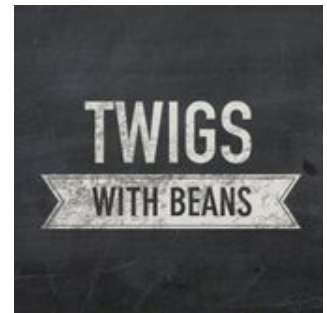
Twigs with Beans

Swimmattix Swim School offers Toddswim, Learn to Swim, Squads, Adult (learn to swim) and Master Squads and private lessons. All their instructors are fully qualified and registered with Western Province Aquatics and Swimming of South Africa. Swimming lessons take place in indoor heated swimming pools.