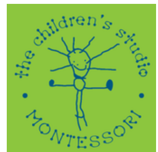
The Children's Studio

garden-setting, mornings and evenings, in Harfield Village in the Southern Suburbs of Cape Town. The classes include a good yoga workout, with a wide variety of postures, and are concluded with relaxation and Pranayama (breathing exercises) at the end of the class. Altogether it's a comprehensive yoga practice leading to increased flexibility, strength and well-being.