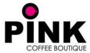
Pink Coffee Boutique